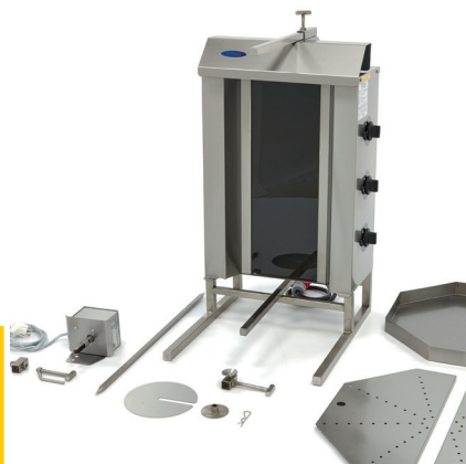
Easy to dismantle and clean