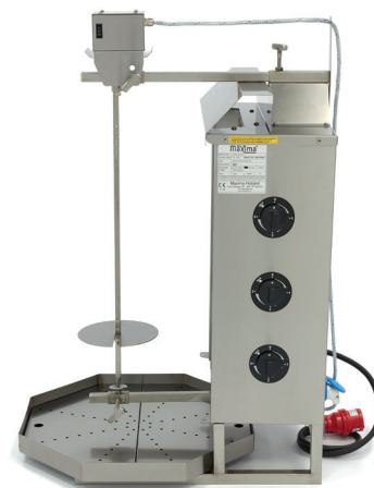
With adjustable skewer for perfect preparation.